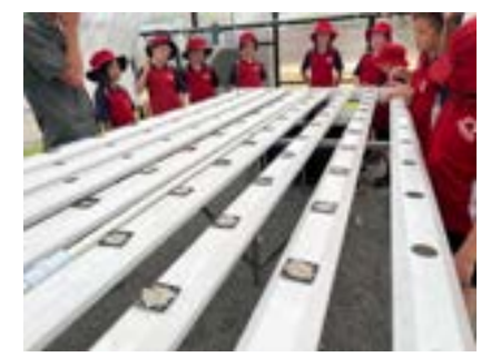
Grade 2,3,4 learning about the food ladder