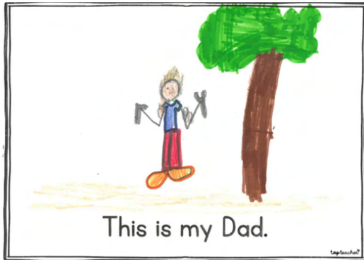
Father's Day artwork by Elsie