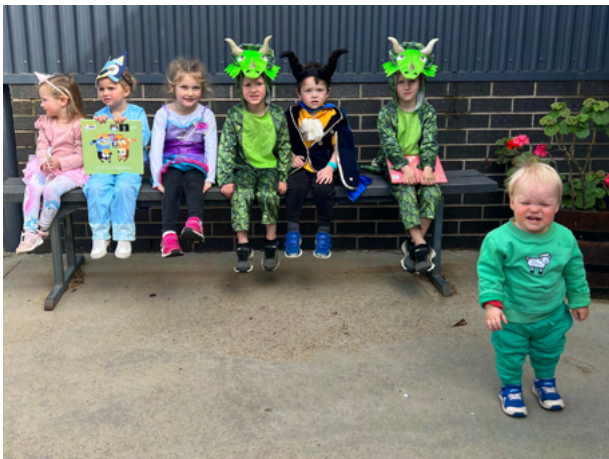
Shake Rattle & Read friends all dressed up