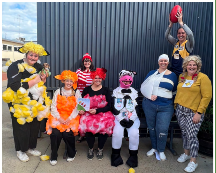
Staff in their creative costumes