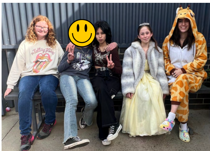
Senior students also participated