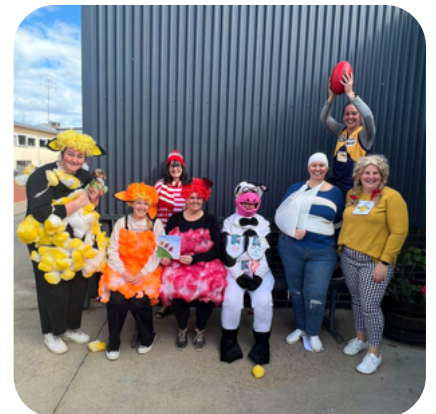
Our wonderful staff getting in to the spirit of book week