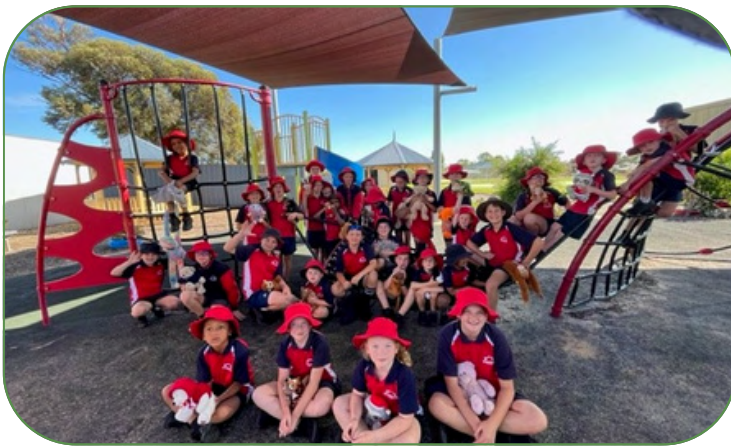
The P/1/2 students with their Grade 5/6 buddies and lots of cuddly friends!