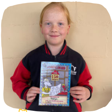
Adalyn 150 Nights