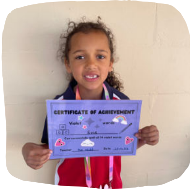
Evie can spell the Violet words