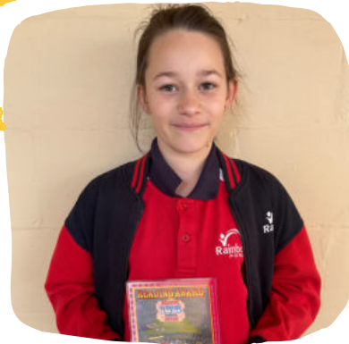
Maddison 175 Nights