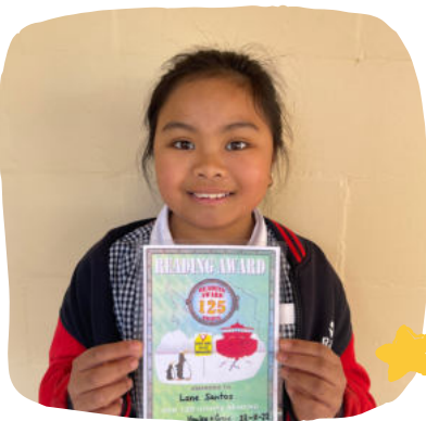
Lane 125 Nights