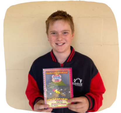
Clancy 175 Nights