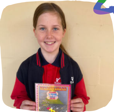
Ava 175 Nights