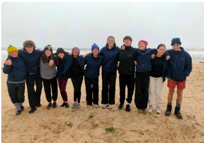
Our students with the rest of their 1A group

As well as outdoor classes we have a number of indoor classes. There are 9 main learning concepts. Learning Strategies, Emotional Management, Resilience, Identity, Empathy, Respectful Relationships, Collaboration, Health and Wellbeing and Environments. We learn about these all throughout the program and every outdoor class is based around them as well. One of the classes we have is to plan our community learning project. Once we plan this project, we are asked to implement it back home. For this we have chosen to do a Breast Cancer Awareness day which we are hoping to hold at the Oasis for the whole community to come and get involved in.