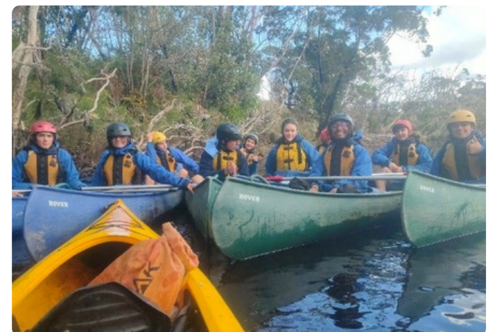
Canoeing on the Yeerung river

As well as outdoor classes we have a number of indoor classes. There are 9 main learning concepts. Learning Strategies, Emotional Management, Resilience, Identity, Empathy, Respectful Relationships, Collaboration, Health and Wellbeing and Environments. We learn about these all throughout the program and every outdoor class is based around them as well. One of the classes we have is to plan our community learning project. Once we plan this project, we are asked to implement it back home. For this we have chosen to do a Breast Cancer Awareness day which we are hoping to hold at the Oasis for the whole community to come and get involved in.