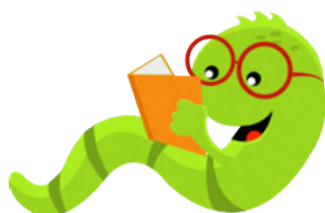
Elsie - 200 nights