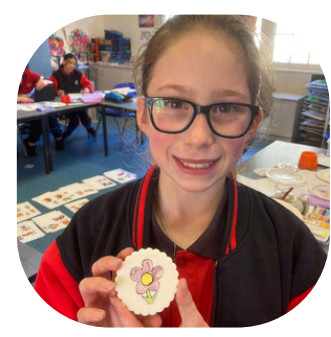
Annika design was a flower

On the 3rd of August , could all students in this elective please bring a white t-shirt - it needs to be cotton! Some students may have one from a colour run day that they can use.