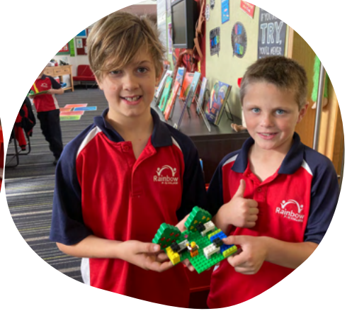
Will and Harry