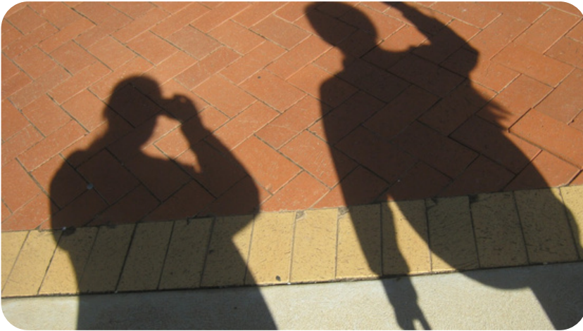
Amelie playing around with shadows