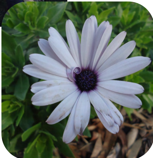
Right: Addison found the beauty in this flower's imperfections