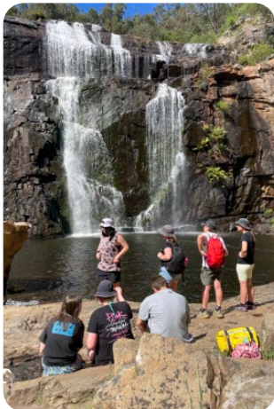
Enjoying MacKenzie Falls