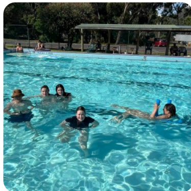
Relaxing at the Halls Gap Pool