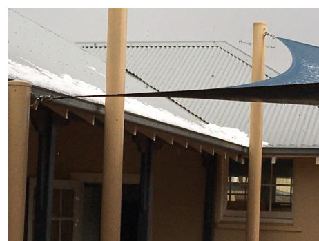
The drain pipes were blocked with ice!!!