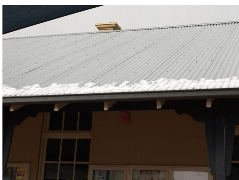
Looks like it has been snowing