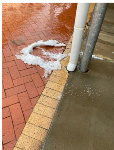
From the gutters

The hail storm we had Thursday afternoon was an adventure. Here are a few of photos of what it looked like after the event!