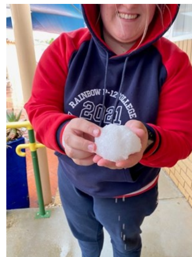
Bronte with a collection!