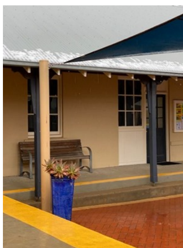
On the roof