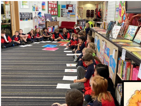
Prep to Yr 6 students ready to share their stories