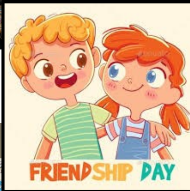
Sharing our ways to keep friends on Friendship Day