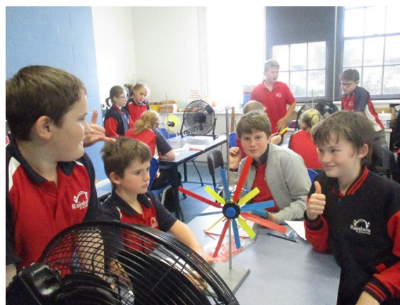
Hands on activities on Ecolinc day were enjoyed by all the students