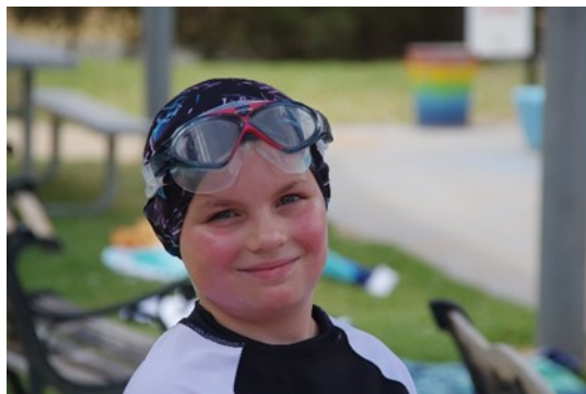
Edison ready for action