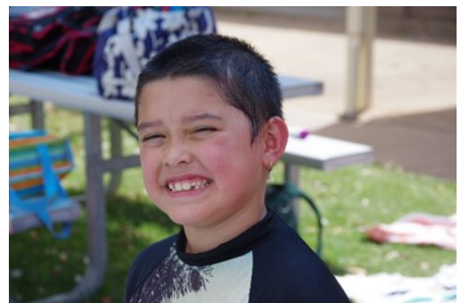
All smiles from Phoenix