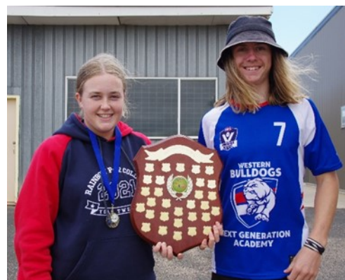
WELL DONE HINDMARSH!