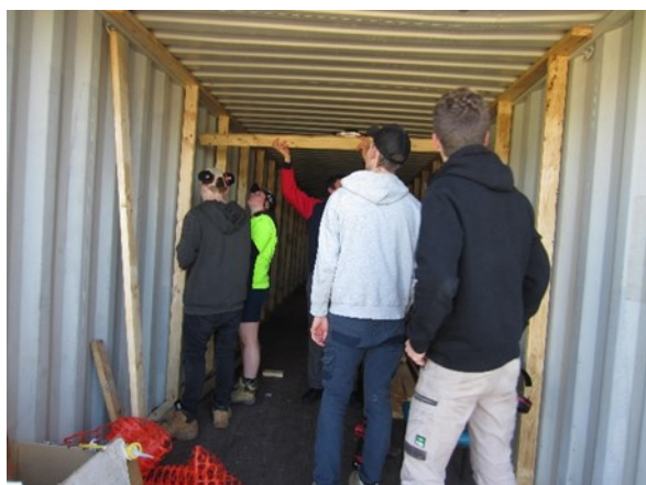
Taking some measurements