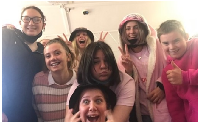
What you happen to find on the ipad!