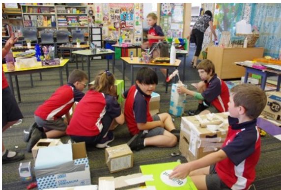
The Ozobot city in action