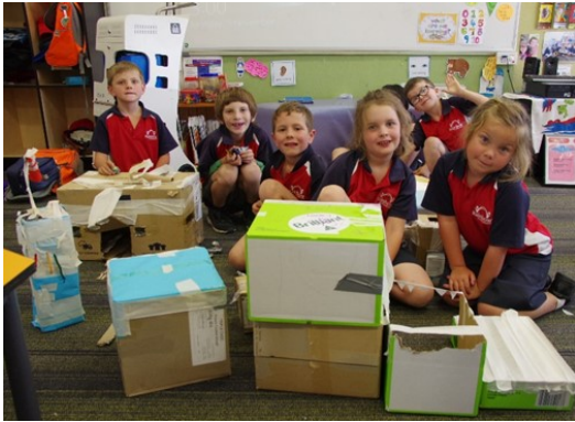
Prep/One with their Ozobot

A visual summary of some of the events from this week