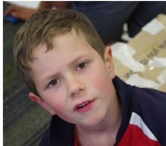
Murphy deep in thought!