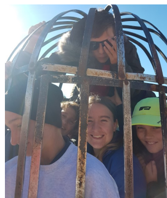
We fit 9 people inside the 'torture' cage.

On our camp at Kryal Castle, we experienced real medieval torture in the torture museum. We saw many devices including the wheel, neck pierces, a stretching rack and the device for chopping off a head. The neck and wrist pierces had metal spikes to pierce your skin and muscles. The stretching rack and wheel had dummies on them with fake blood spilled all over them and the stretching rack had a mouse on them. We also learned that the longer an execution went on the more the executioner was paid. An execution could sometimes go on for days, weeks, months or even the person's lifetime. A few people had to go outside to get some air. After that we had a chance to go down into the dungeon. We went down to the dungeon and came to this room where chains were hanging off the ceiling and then we heard the scream of a person that had their head cut off. We walked further down the dungeon and saw a dummy on a stretching rack and there was another scream. By this time, we were really spooked out and we half ran down the path. When we turned the corner, we saw three heads on their own spike. We were running down the path by now and we half pushed the door down trying to get out. It was a really fun camp!!!!!!!!!!!!