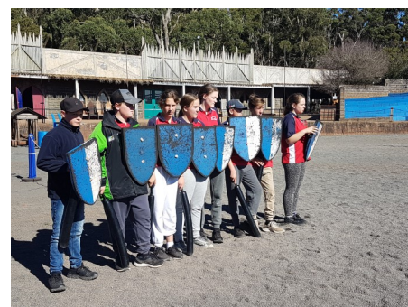
Blue teams shield formation!