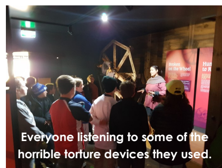
Everyone listening to some of the horrible torture devices they used.