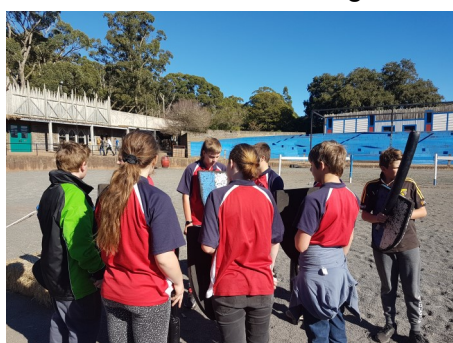
Blue team in a huddle to figure out their strategy.