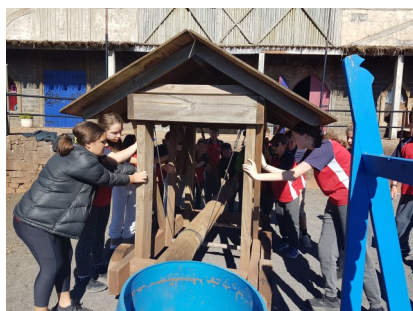
The team moving the battering ram into position.

They had to work together to get it to spin.