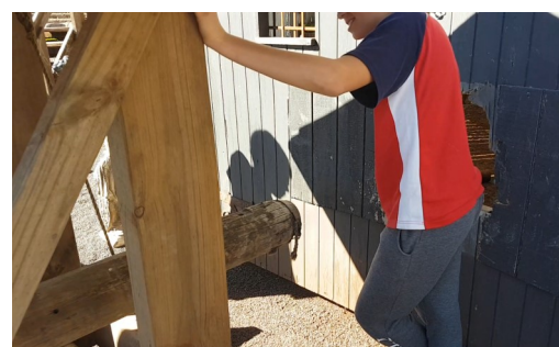
The battering ram about to knock down the door.

At Kryal Castle on Thursday the students did the old style Battering Ram which is a long wooden plank on wheels with a bit of metal on the end. The battering ram is used to knock open doors. We were split in two groups and the winner was the group to do it the fastest and most successfully. There was only two people allowed to talk the captain and the vice-captain. It was very fun and overall our group won. I strongly recommend it.