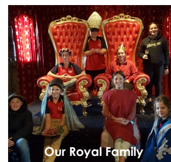
Our Royal Family