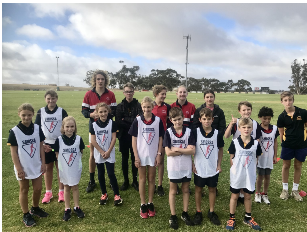
Rainbow P-12 Cross Country Team