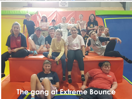
The gang at Extreme Bounce

We arrived there at 9:30 and we had an introduction and the rules were set. Overall my favourite area was the slam dunk trampoline, we left at 11am.