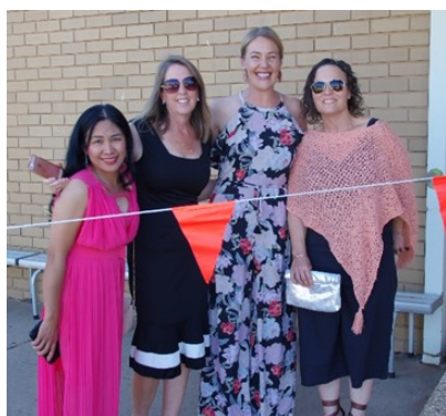
Some of the mums at the Graduation Dinner