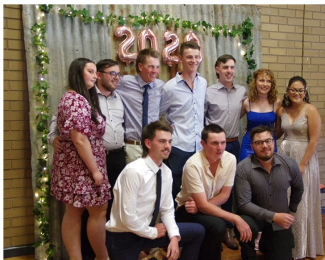
The Class of 2020