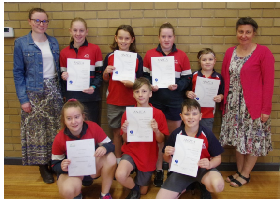
Students recently completed their ANZCA piano exams over grades ranging from Preparatory to Grade 3.