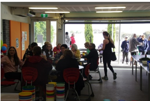
The Back-to BIG breakfast was a great hit with visitors