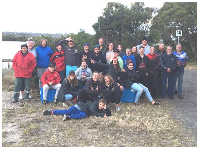
Fishing with the Bellarine Light Game & Fishing Club Members