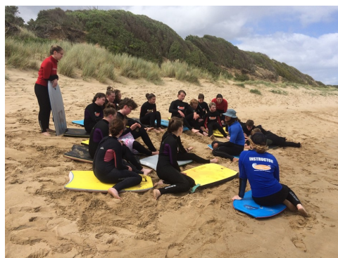
On the Beach