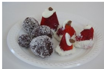
Yummy Christmas plate