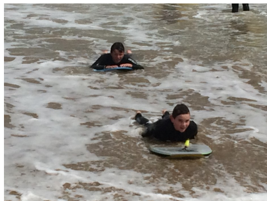
Catching a wave