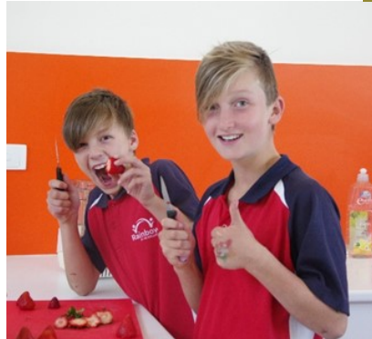
This is a bit of a worry!