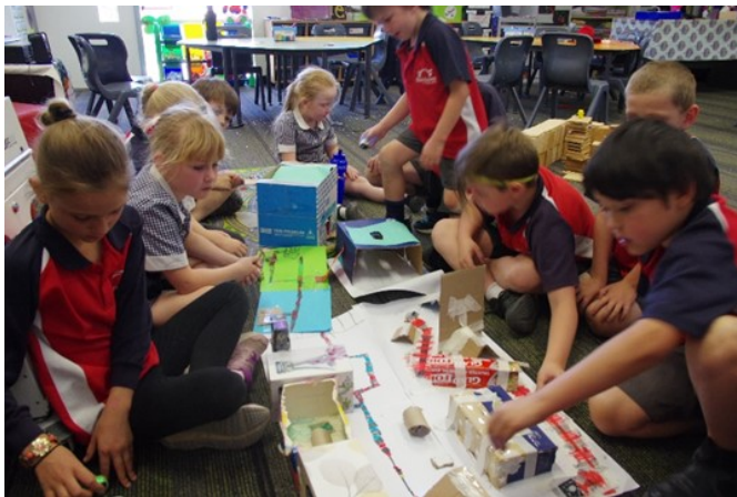
Prep/1 ozobot city in action