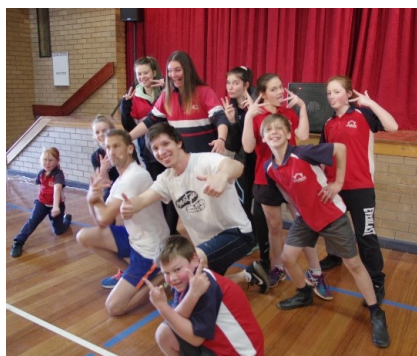
The Hip-Hop dancers and the gang!