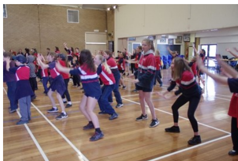
Great to see everyone getting into the hip hop!