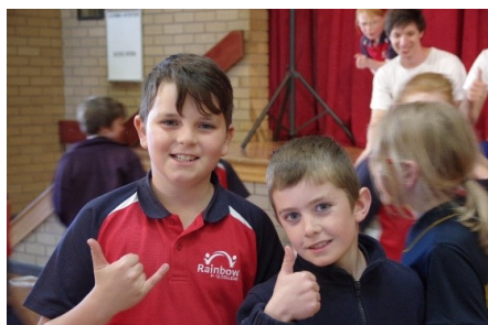
Baxter & Kane getting involved