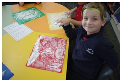
Edi proud of his efforts