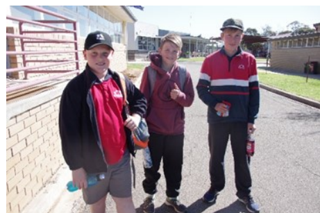
Some of our golf crew