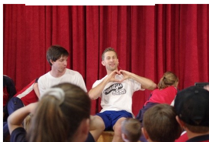
Showing the love!