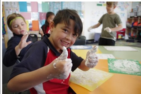
Phoenix with two thumbs up

A visual summary of some of the events from this week