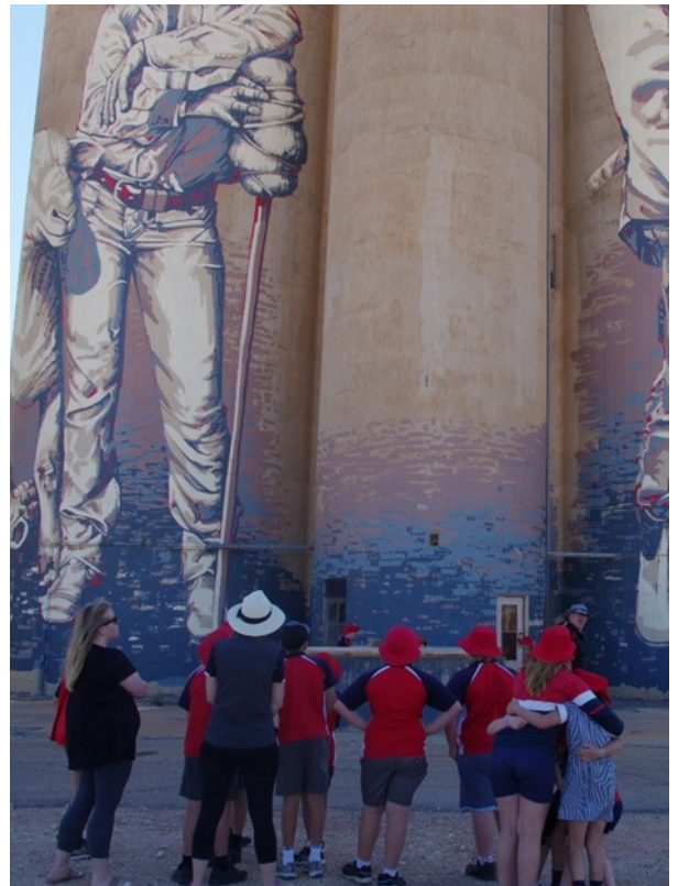
Taking in the view