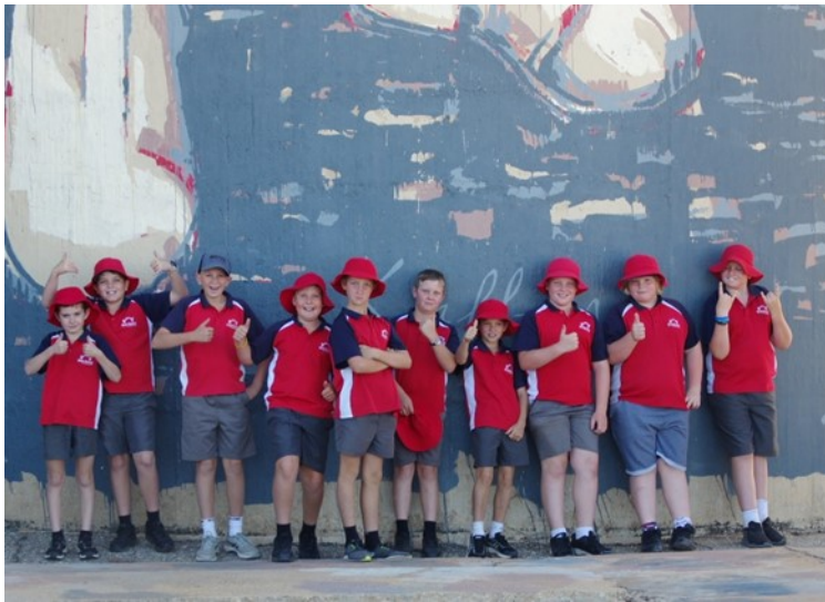
Some of our lads!