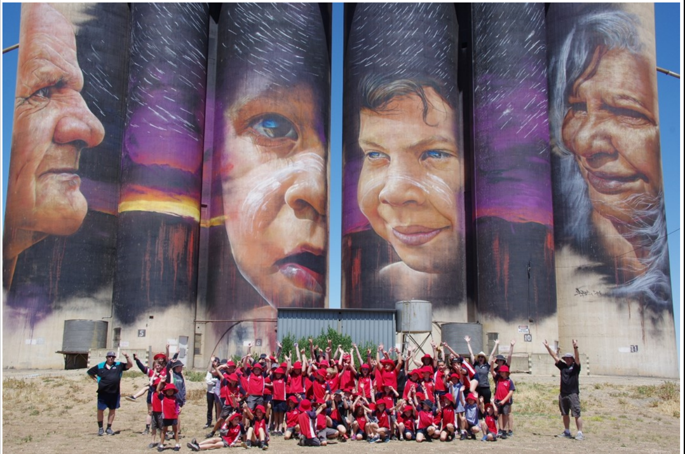
The crew with a breathtaking backdrop