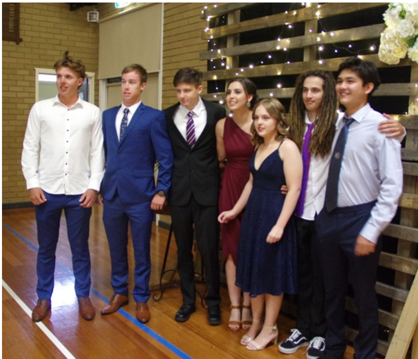
Our Graduating class of 2019