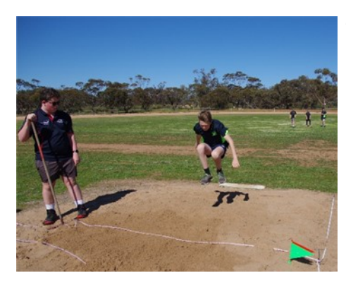
Jumping, running, throwing