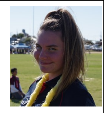
Some of the Dreamchasers crew