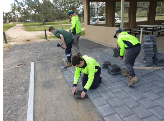
The students are pictured laying the pavers.