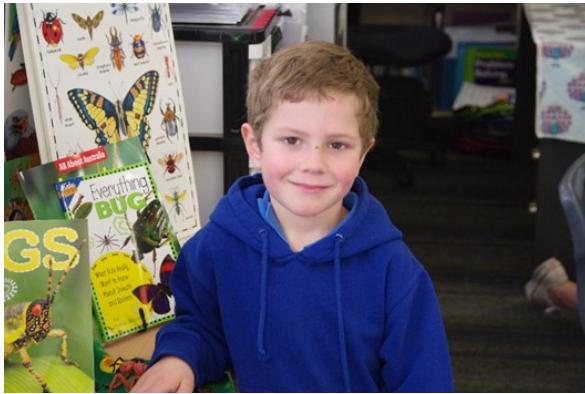
Murphy checking things out