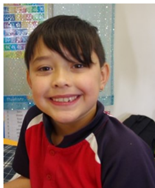
Great smile from Phoenix