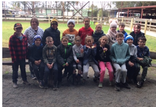
A happy group of Year 3 & 4 students on camp