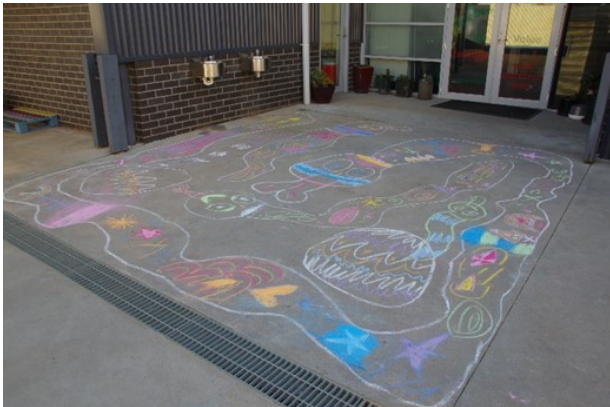
The creative chalk art from the play to learn session last Friday

A visual summary of some of the events from this week