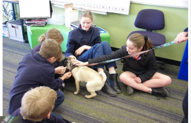
The junior school was lucky to get a visit from Billy the pug...who definitely loves having his photo taken!