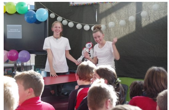
NAO assistants in their element