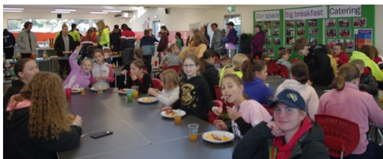
Our Big Breakfast crowd!