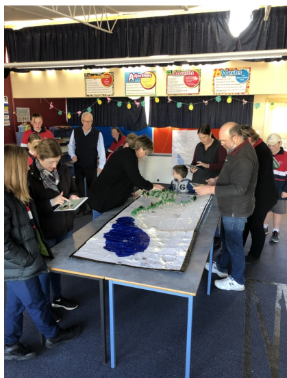
Yr 7/8 Humanities students proudly show their Mallee Waterways assignment to parents & staff

Thank you to the Rainbow Archives, Wimmera Mallee Pioneer Museum and Wimmera Catchment Management Authority for their assistance in completing this project.