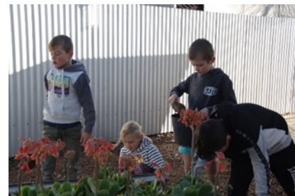
A team effort at weeding!