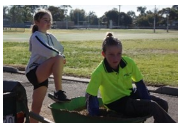
Guess who loves the Camera?