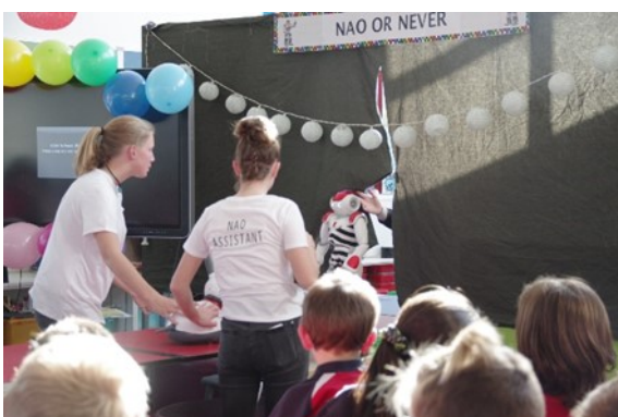
NAO ready to come out in a different costume