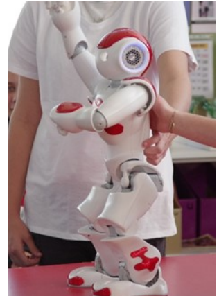
NAO (Tanoshi) in dance mode