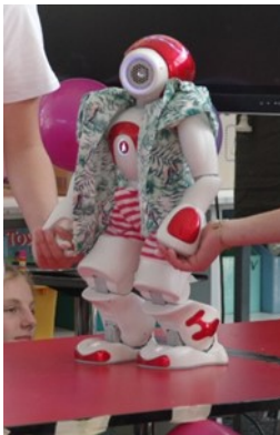
Love the outfit