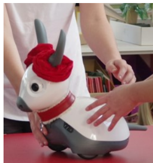
Gavin in action