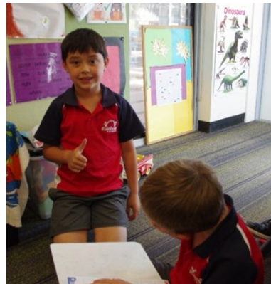
Phoenix helping others out