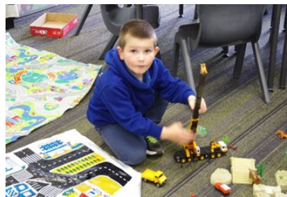
Hendrix in action