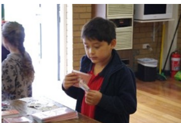
Phoenix making a hard choice at the Mothers' day stall