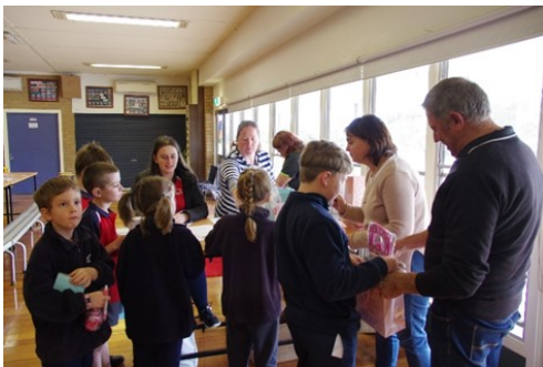
The 2/3/4 classes at the Mothers' Day stall