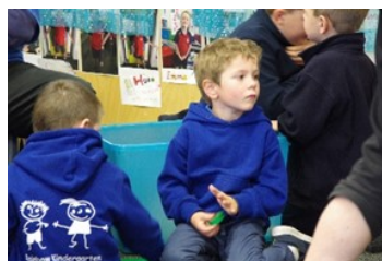
Murphy checking things out!