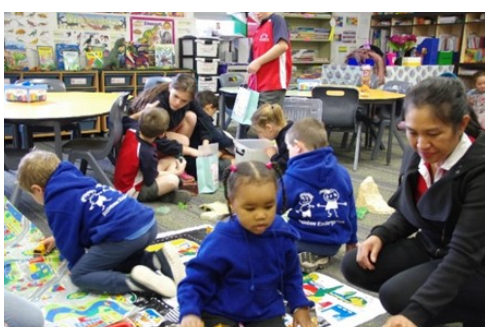
Kinder kids in action