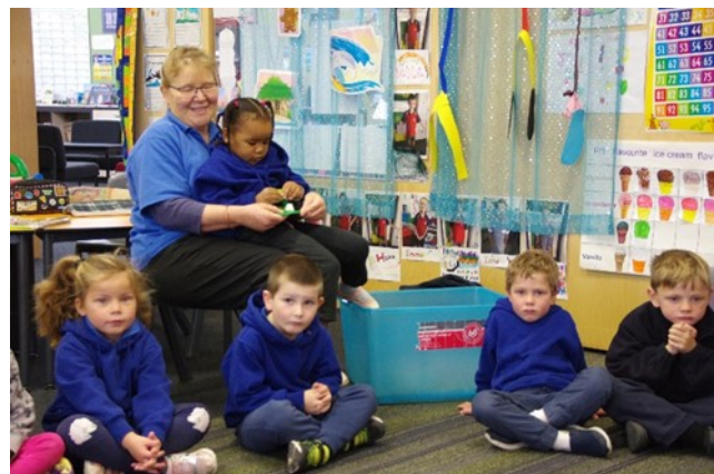
The kinder kids ready to get into the activities