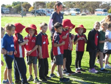
Ready to go!

A visual summary of the SM Cluster Cross Country camera!