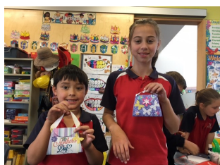
Phoenix & Millie