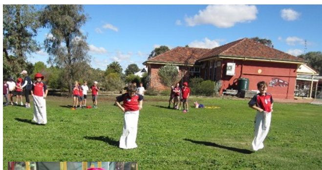
Good old fashion sack races