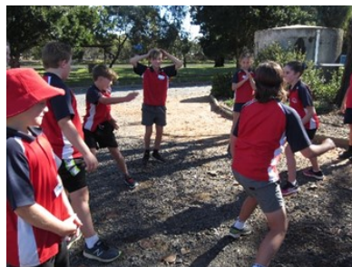
The ninja game