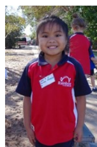
All smiles from Lane