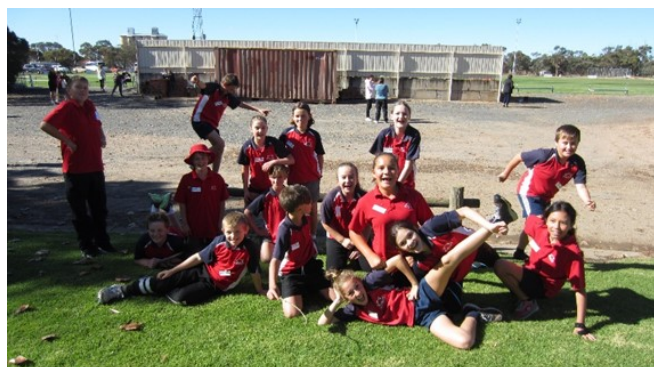
The 5/6 crew.... They are unique