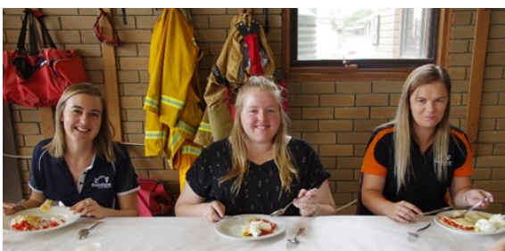
The three wise....teachers?