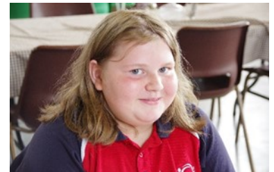
Sharni ready for action