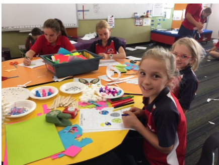
Easter activities fun

On Tuesday lunchtime over 30 students participated in lunchtime activities that were based on an Easter theme. Students were able to choose from a variety of craft ideas such as Easter puppets, head bands, baskets, fun Easter glasses, Chupa chups bunnies and cards to name a few. Special thanks to the years 6, 7 and 8 students and Claire Roll who assisted.