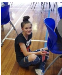
Angel giving the final touches