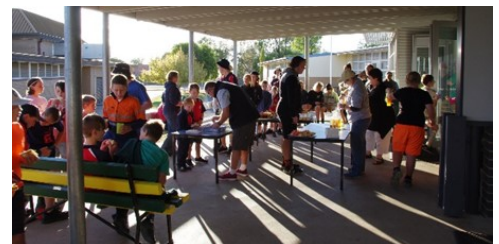
Big turn out at the big breakfast