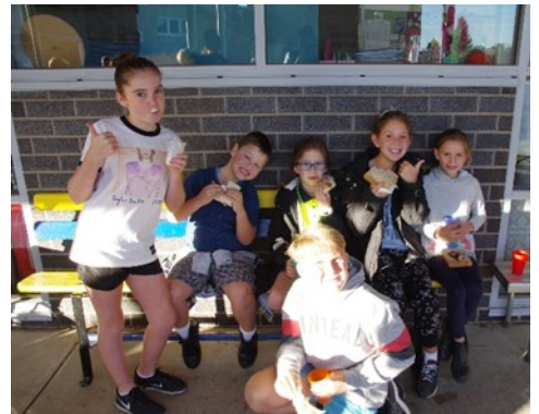
All enjoying a BIG breakfast!