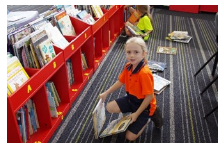
Inara neatening up the Library