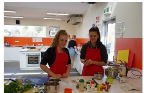
Jas & Ash helping prepare the food