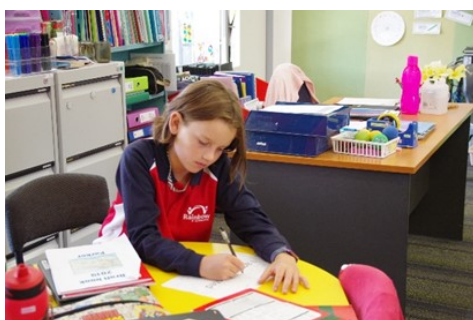
Cooper in serious concentration mode

I liked learning about the meaning of Mallee Sky & where the book was set. Holly