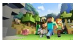
Tech time - minecraft central!