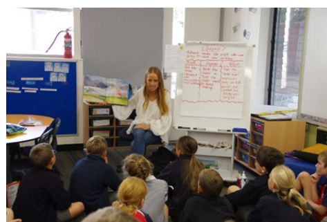
The 3/4 students listening intently to her book