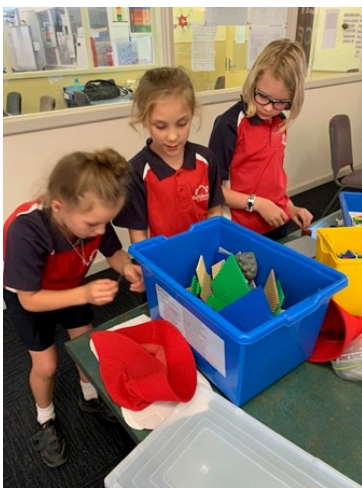
Lego in action at Tech time