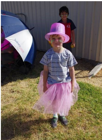
Hugo ready for action!