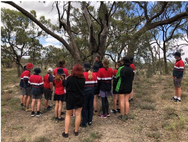
Students gather around to observe a scar tree