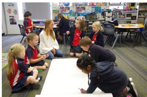
The Prep/1/2s drawing a mural of the Mallee