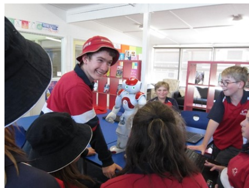
Flynn & NAO having a great conversation!