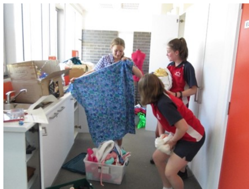
7/8 DigiTech girls checking out material for robot costumes