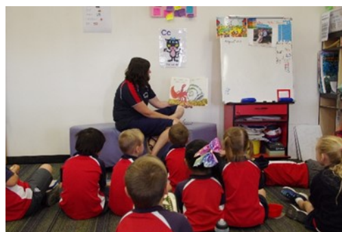
Storytime in the Prep/1 room....