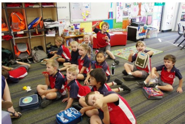
Our Prep/1s hate the camera!!