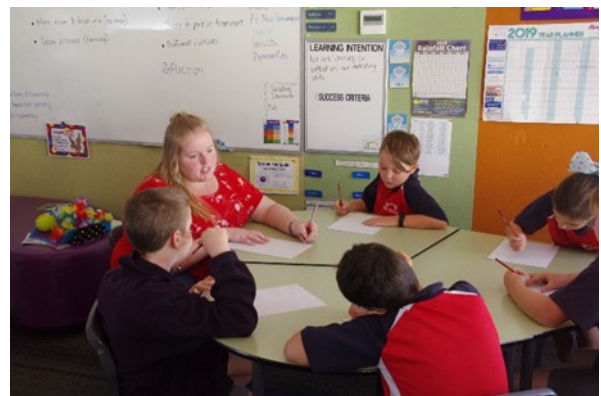
Miss Teasdale in action!