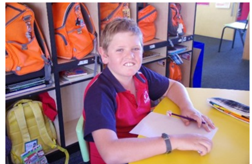
Oscar ready to work!