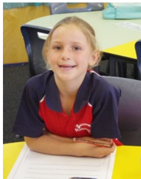
Pippa looking very keen