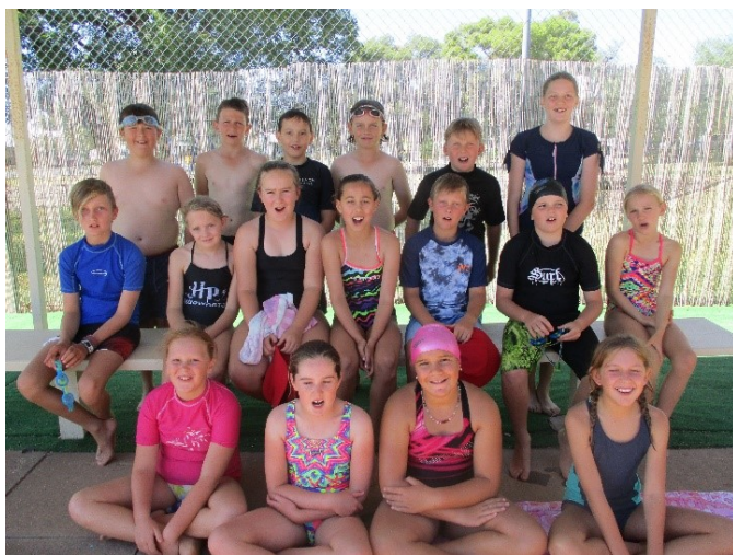
Rainbow P-12 Junior Swimming Team