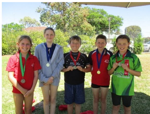
Championship place getters