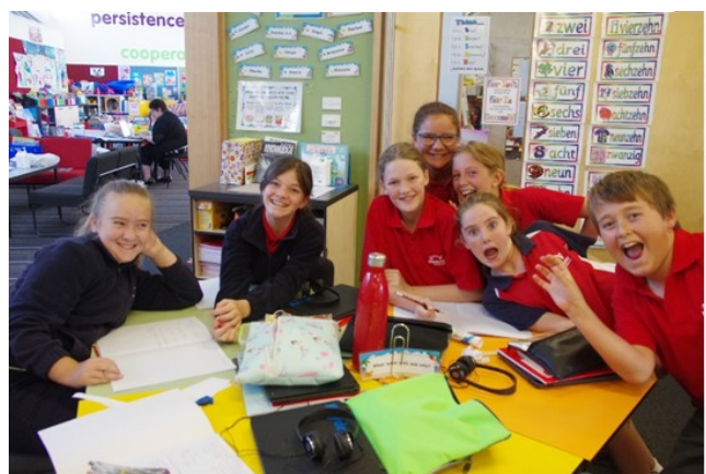
Some of the Grade 5/6 crew