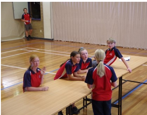
Year 7/8 Digitech construction group planning the stage for the robot fashion parade