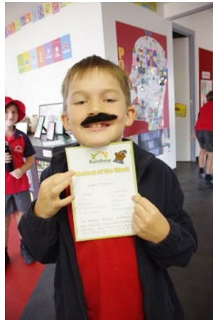
Who is this handsomely moustached lad?